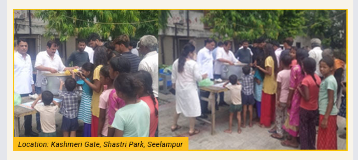
During a 3 day food distribution drive , 250 meals along with 30 ration kits consisting 15 days ration for a family were distributed .

In response to the floods caused by the overflowing Yamuna River in Delhi , a concerted effort was launched to provide aid and support to the affected communities , particularly the poor families residing in the nearby areas. The floods had left families displaced and struggling to meet their basic needs, including access to food and clean water.